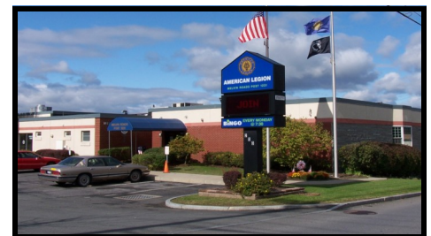
Melvin Roads Post 1231 200 Columbia Turnpike Rensselaer, New York 12144